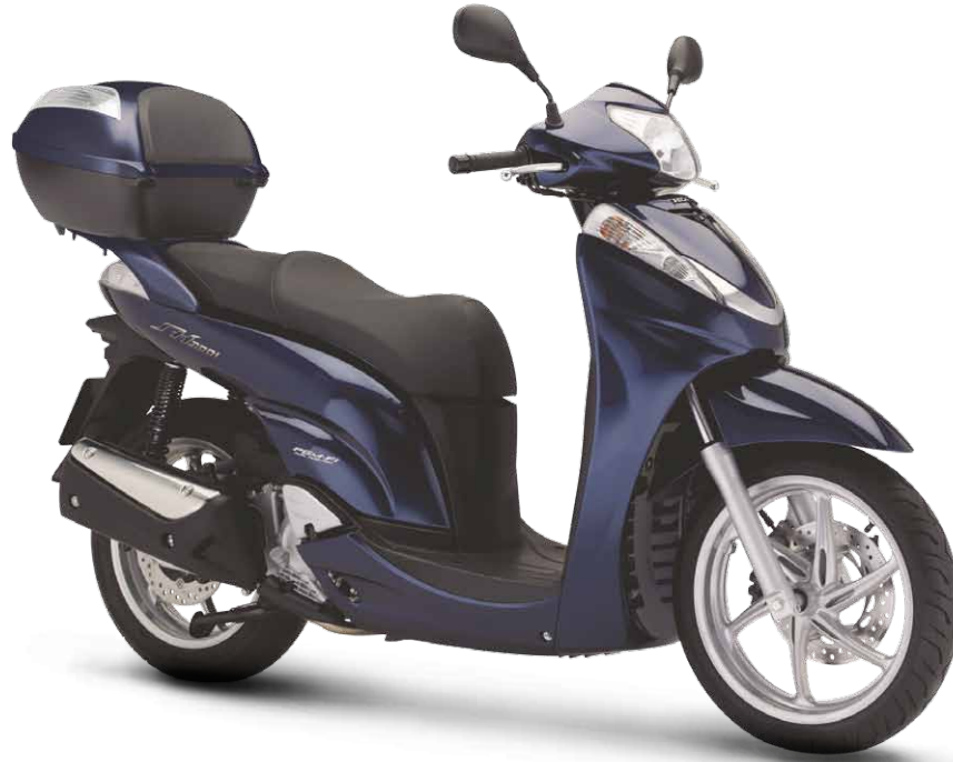
*Rear Topbox Standard

The remarkable SH300i brings top performance and carefree riding together in one of the sexiest commutes to be found on two wheels.