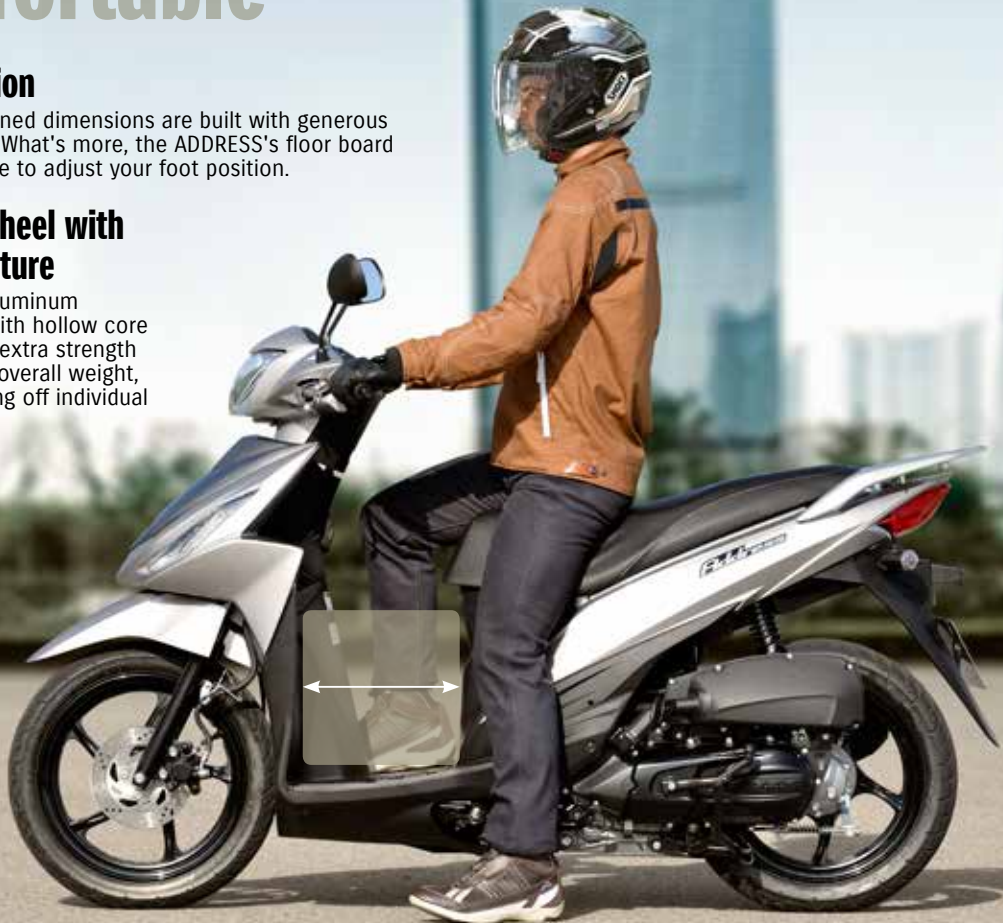
*Rider height 165cm

Sporty-looking aluminum casting wheels with hollow core architecture add extra strength and help reduce overall weight, as well as showing off individual distinction.