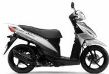
Metallic Ice Silver (YNJ)

Images shown in this catalogue contains computer-generated composites. Specifications, appearance, colours (including body colour), equipment, materials and other aspects of the "SUZUKI" products shown in this catalogue are subject to change by Suzuki at any time without notice, and they may vary depending on local conditions or requirements. Some models are not available in some regions. Each model may be discontinued without notice. Please inquire at your local dealer for details of any such changes.