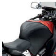
HAYABUSA TANK COVER