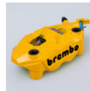
BREMBO LEFT FRONT BRAKE CALIPER, YELLOW