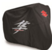
HAYABUSA MOTORCYCLE COVER