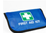
FIRST AID KIT - LARGE