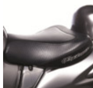
GEL SEAT - HAYABUSA