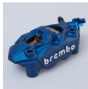
BREMBO LEFT FRONT BRAKE CALIPER, BLUE