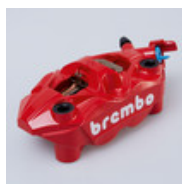
BREMBO RIGHT FRONT BRAKE CALIPER, RED