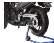
REAR SERVICE STAND