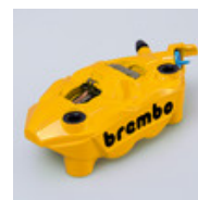
BREMBO RIGHT FRONT BRAKE CALIPER, YELLOW