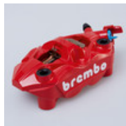
BREMBO LEFT FRONT BRAKE CALIPER, RED