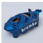
BREMBO RIGHT FRONT BRAKE CALIPER, BLUE