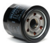
GENUINE SUZUKI OIL FILTER